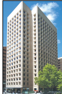
45 Grenfell Street Sold for $29m 10.75% initial yield

Buyers are generally thin in the market for assets above $10 million, with continuing concerns regarding the availability of finance and a belief that distressed assets may be brought to market sooner rather than later, placing renewed upward pressure on yields.