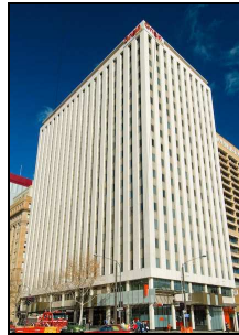
1 King William Street Sold for $38.61m 9.60% initial yield

Despite strong fundamentals in the office market, low unemployment rates and steady white collar employment, commercial investment sales are being transacted at yields 1% to 2% above pre Global Financial Crisis levels.